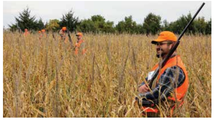
Hunters walk fields at Horseshoe K Ranch in Kimball during last year's Bishop's Charity Hunt.

431 N. Cliff Avenue • Sioux Falls, SD 57103 • 605-335-5823 Open Mon-Thur 9-5, Friday 9-6 & Saturday 9-5 All donations are tax deductible.