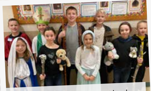
Roncalli Elementary students, Aberdeen