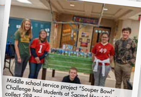
Challenge had students at Sacred Heart (Yankton) collect 288 cans of food for the Contact Center.