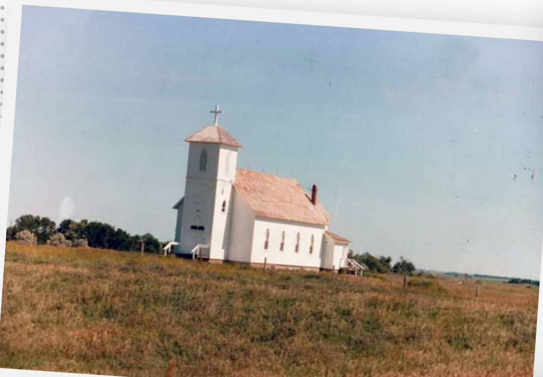
BENDON HOLY TRINITY

About 14 miles from Kimball, a Catholic Church named St. Prokopa was built in 1883. It was broken up, and people began attending Red Lake, until in 1894 a church was built, now called Holy Trinity, close to Kimball, and 5 years later a parish house. In 1900-1901, the church was served from Kimball, and in 1901 Bendon Holy Trinity received a resident priest. There was a resident priest also in 1906-1908, and 1910-1911, until the parish was closed September 7, 1911. The people were attached to the Kimball St. Margaret's Parish, and Mass was offered at Bendon once a month.