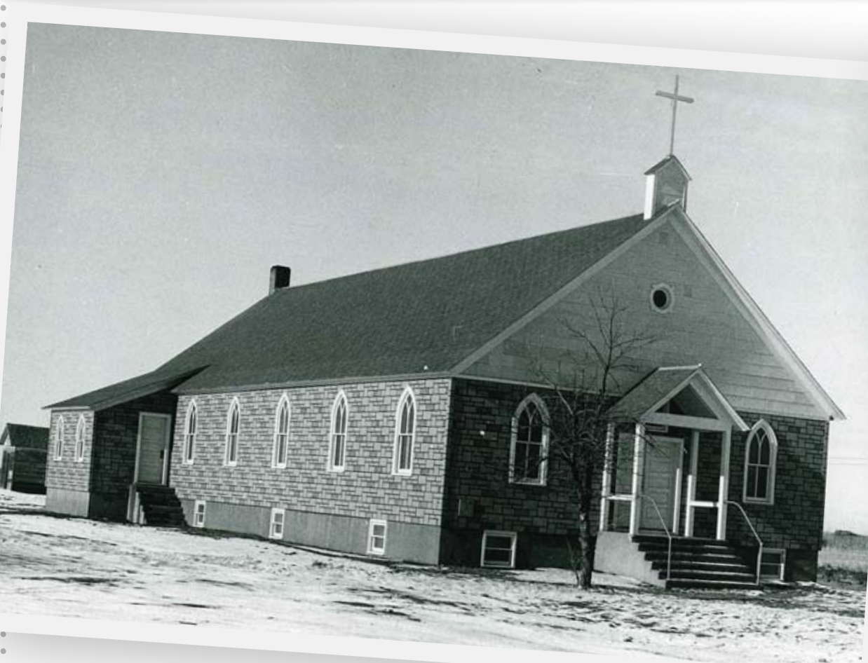
Harrold (Hughes County) St. John (the Evangelist)