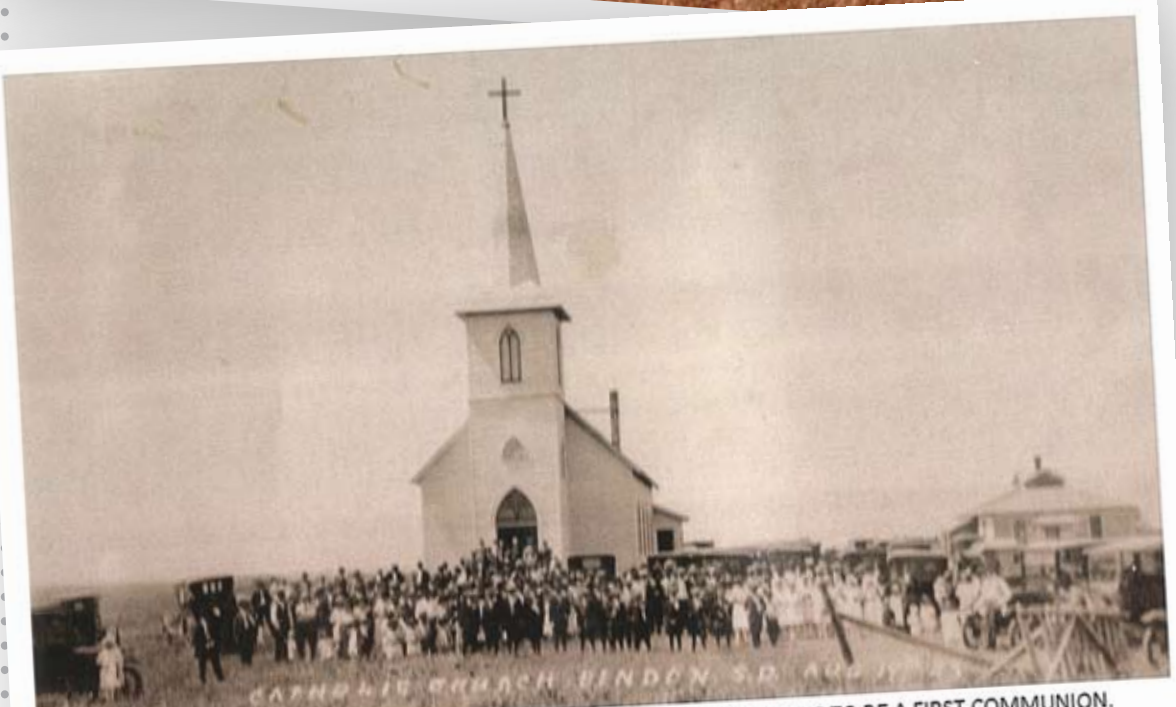
A SPECIAL OCCASION AT BENDON CHURCH, AUGUST 18, 1923. IT APPEARS TO BE A FIRST COMMUNION. COMPARE THE STEEPLE WITH THE ONE IN THE PICTURE BELOW. IT WAS LOWERED AT SOME POINT. NOTICE THE RECTORY TO THE RIGHT. IN ITS ORIGINAL LOCATION, IT FACED EAST. THE CEMETERY IS LOCATED SEVERAL HUNDREDS TO THE LEFT OF THE CHURCH AND DOWN A SLOPE. THE CASNET WAS CARRIED FROM THE CHURCH TO ITS PLACE OF REST BY THE PALLBEARERS.