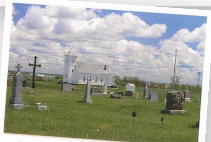
THE HOLY TRINITY CHURCH OF BENDON AT ITS PRESENT LOCATION NEAR ST. MARGARET'S CEMETERY.

About 14 miles from Kimball, a Catholic Church named St. Prokopa was built in 1883. It was broken up, and people began attending Red Lake, until in 1894 a church was built, now called Holy Trinity, close to Kimball, and 5 years later a parish house. In 1900-1901, the church was served from Kimball, and in 1901 Bendon Holy Trinity received a resident priest. There was a resident priest also in 1906-1908, and 1910-1911, until the parish was closed September 7, 1911. The people were attached to the Kimball St. Margaret's Parish, and Mass was offered at Bendon once a month.