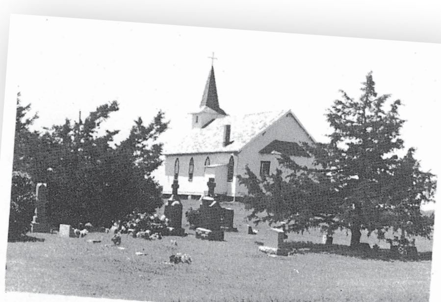
Beautiful cemetery at Saint Placidus!