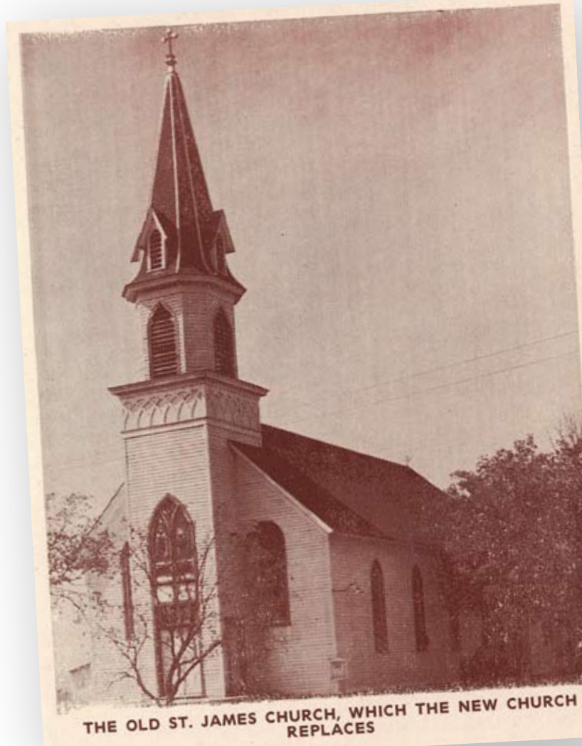
THE OLD ST. JAMES CHURCH, WHICH THE NEW CHURCH REPLACES