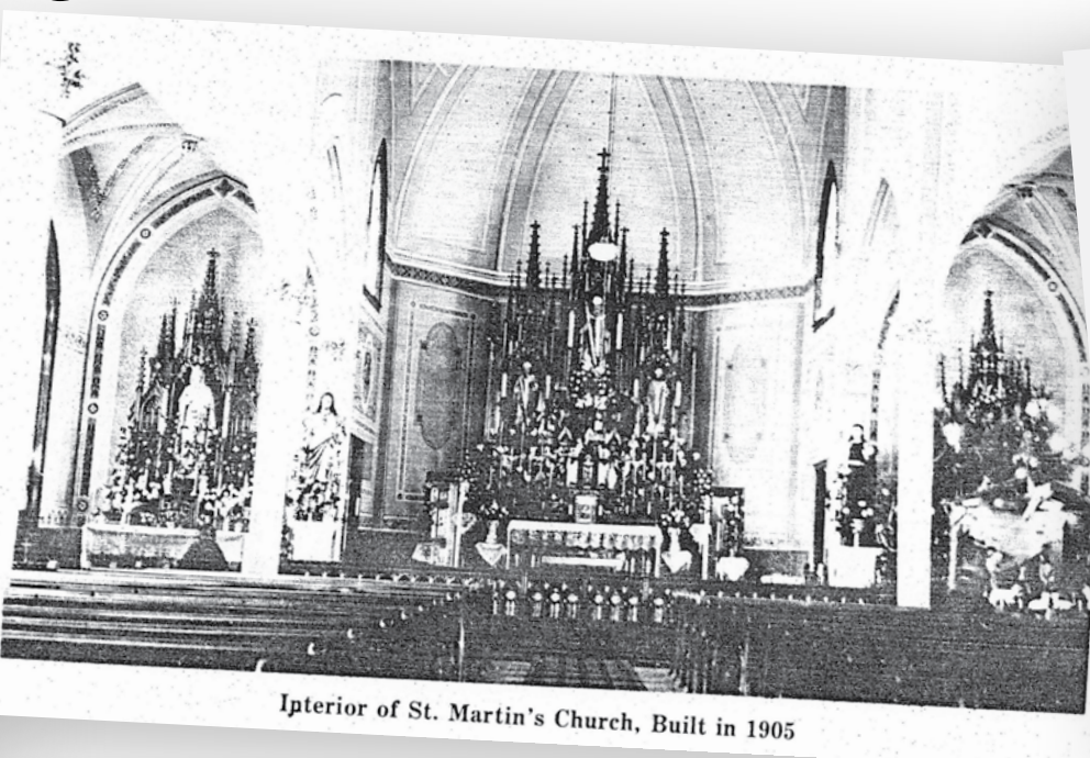
Interior of St. Martin's Church, Built in 1905