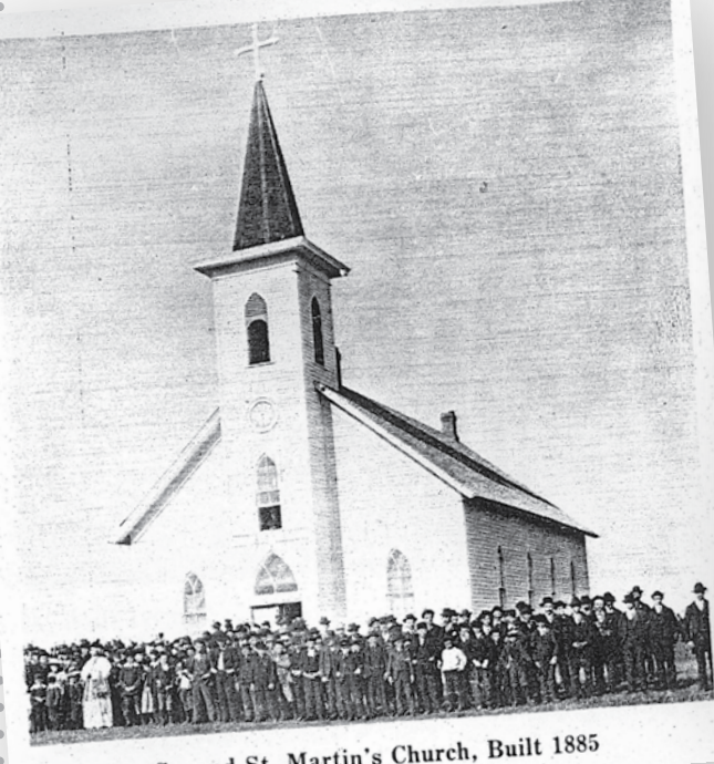
Second St. Martin's Church, Built 1885