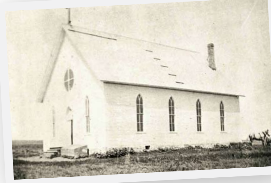
CENTENNIAL OF ST. ANN'S CHURCH OF BADUS LAKE COUNTY, SOUTH DAKOTA 1884 - 1984