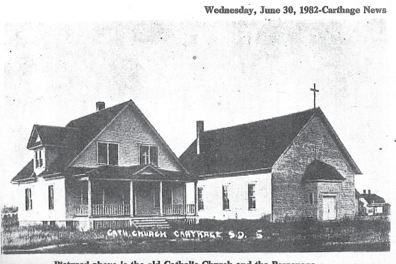
Wednesday, June 30, 1982-Carthage News