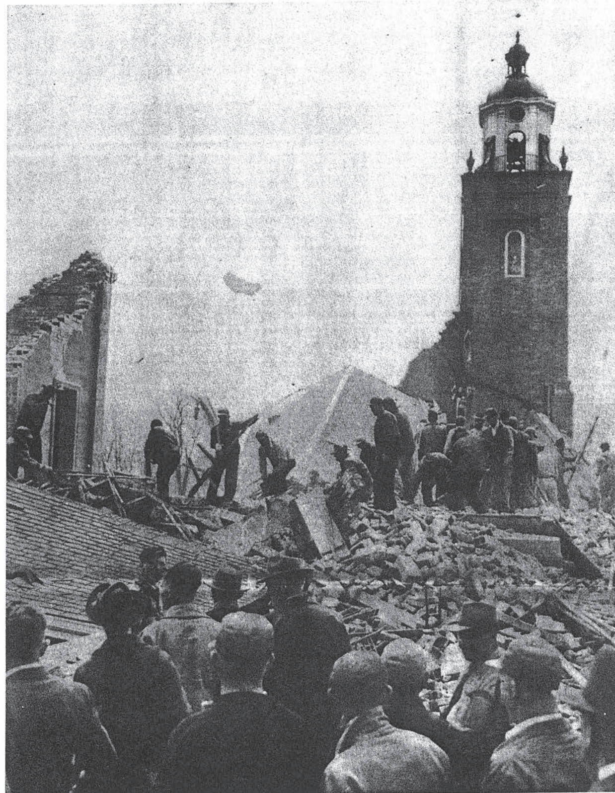
The worst tragedy in the first hundred years of the diocese occurred at Marion on April 10, 1949, when an explosion destroyed St. Mary's Church and killed six parishioners. They were the only known deaths attributable to the dozens of storms and fires which battered churches, schools and rectories, seemingly in a continuing test of faith. Over and over again the people rebuilt with the hope and tenacity of the early Dakota pioneers.